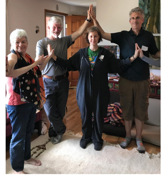
Yoga of Mutuality: Fierce Ardor Workshop, Olympia, May 2019